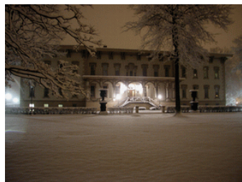
Genesis House, Williamsport