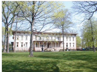
Firetree, Ltd. Corporate Office, Williamsport, PA

Firetree, Ltd. is growing again! We are pleased to announce the addition of five new facilities to the Firetree family. Three of the facilities will house short and long term inpatient programs and two will provide outpatient services. In addition, Community Reentry Services may be available at some of the buildings as well as additional treatment services such as detox. Each facility name, location and information is listed below: