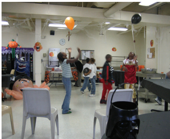
Capitol Pavilion's young guests enjoy the Halloween party festivities.