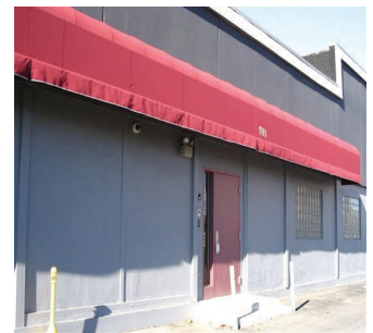
Syracuse Pavilion, Syracuse New York